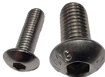
8 x M5x16mm Allan head bolts