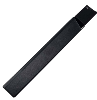
1 x Centre Right Panel