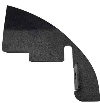
1 x Front Left Small Panel