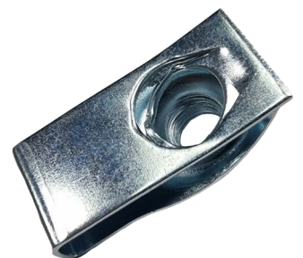
4 x Threaded Clips