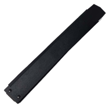
1x Right Front Long Panel