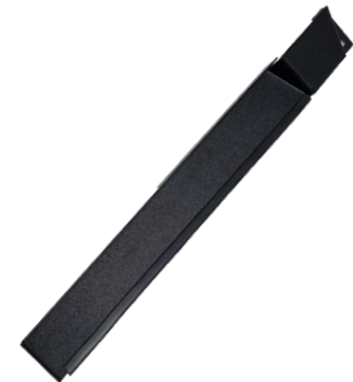
1 x Centre Left Panel