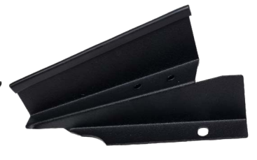
1x Right Rear Panel