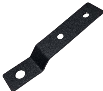
2 x Rear Brace