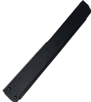
1 x Front Left Long Panel