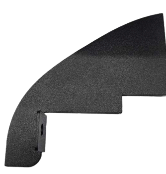
1 x Right Front Small Panel