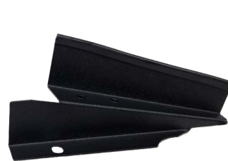
1 x Left Rear Panel