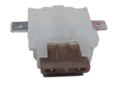
In Line Fuse Spade Connector